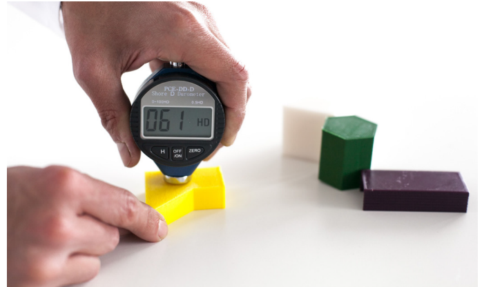
Smart Materials 3D Material Testing