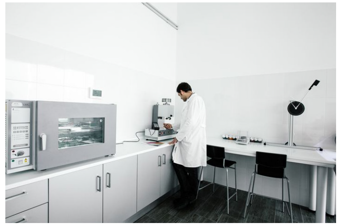
Smart Materials 3D Laboratory